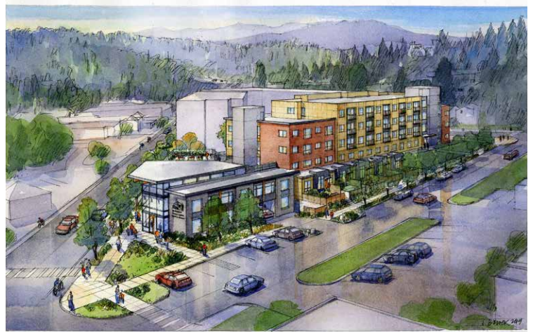
The Phase I building, parking, and landscaping now being built. Rendering by Stephanie Bowers.

The Task Force championed changing the existing plan to increase housing capacity by some 800 units. Both Sehome’s and York’s neighborhood associations worked hard to promote infill proposals for this area. Projects are now coming to fruition, using federal, state, and private funds. As the area attracts new business and housing, it reinvigorates and supports local residents, workers, and entrepreneurs, making it a more livable and affordable subcommunity that also improves the surrounding neighborhoods.